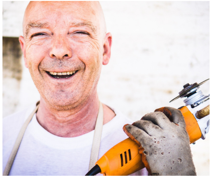
Despite the odds, we witness success every day.

In 1988, the Andre House created St. Joseph the Worker (SJW) in response to a humble plea from homeless individuals receiving dinner in the park: "We want jobs, but we don't have the tools." Since then, SJW has focused solely on empowering men and women who are truly "down and out" to transform their lives through employment. SJW is a non-profit organization that is 100% privately funded.